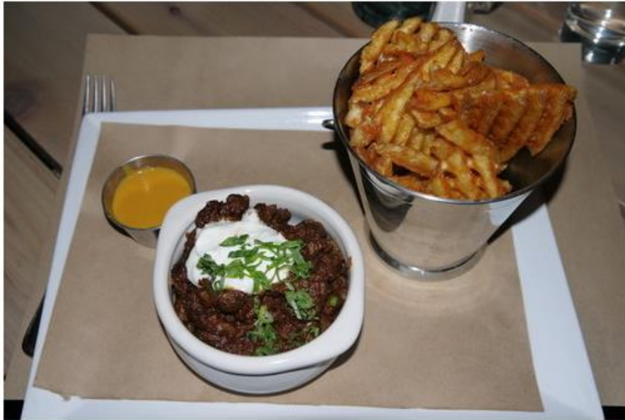
Chili Cheese Fries at Citizens

With all of that under your belt it is time to make your way to your room, at least to let your head hit the pillow for a few hours. The rooms at Mandalay have a great balance of earth tone colors and a current and vibrant feel that you will love. THEhotel , the all suite version of Mandalay Bay, is the last portion of the resort to be remodeled and it will transform into Delano Las Vegas in late 2013.