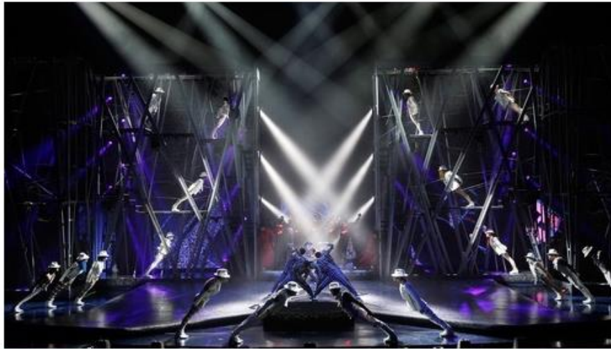
Michael Jackson ONE

I do realize that Light and Daylight do typically have diminishing returns on the guest as you get older, so don't think that Mandalay Bay is all about the under 30 crowd. You can't go wrong in Las Vegas with a Cirque du Soleil show and knowing that Las Vegas always goes big, Mandalay Bay decided to follow suit by combining the two monster brands of Cirque du Soleil and Michael Jackson to create Michael Jackson ONE . Mandalay Bay has consistently put together a wide variety of concerts including: Rihanna, Enrique Iglesias, Black Eyed Peas and Toby Keith. That does not even include all of the weekly activities that are happening at the House of Blues. If that is not enough music for you; how about just strolling through the casino, you can hear some live Frank Sinatra or the Beatles. Just pull up a seat at one of the casino bars, and you never know what you will find, but I came across both of these acts on a recent Saturday night and both were amazing. If you want to be entertained, it is tough to find one location that has as much going on as Mandalay Bay .