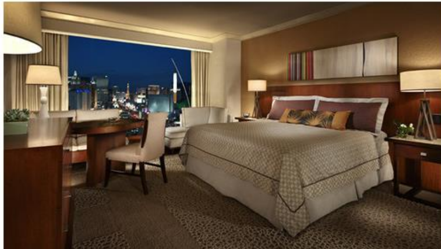
Mandalay Bay Deluxe Room

With all of that under your belt it is time to make your way to your room, at least to let your head hit the pillow for a few hours. The rooms at Mandalay have a great balance of earth tone colors and a current and vibrant feel that you will love. THEhotel , the all suite version of Mandalay Bay, is the last portion of the resort to be remodeled and it will transform into Delano Las Vegas in late 2013.