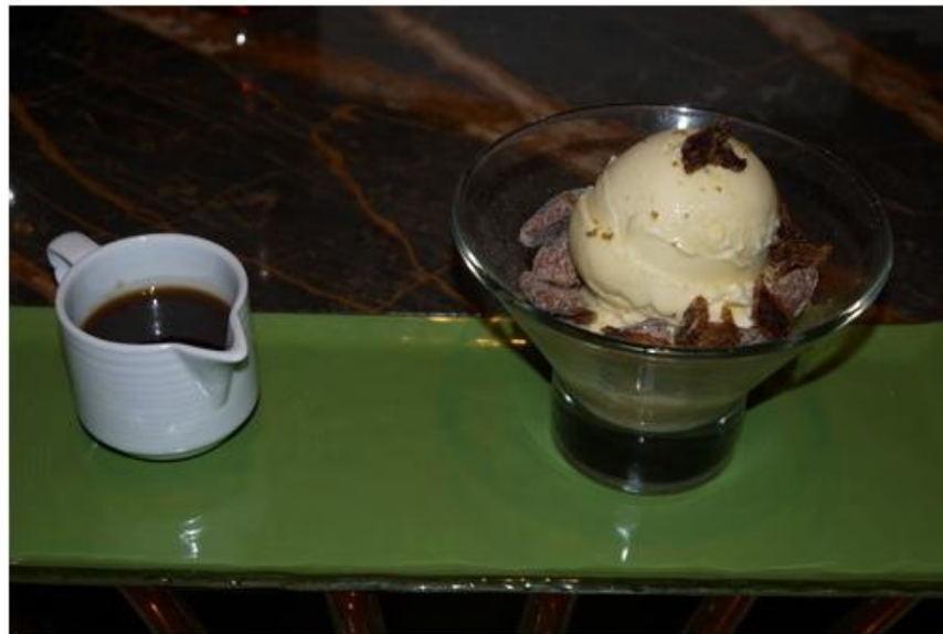
Bacon & Beer Toffee Sundae at Press

After a weekend at Mandalay Bay , you might need to come up for air—and a weekend probably won't cut it, you had better make it an entire week. Mandalay Bay did a little more than reinvent itself; it raised the bar for the rest of Las Vegas.