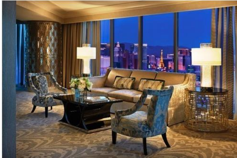
Four Seasons Presidential Suite Strip View at Night

Finally, they created a complete change to the entrance by adding the indoor/outdoor bar Press . You don't have to stay at the Four Seasons to enjoy Press , a stunning bar that put together one of the best menus of food around. There are a few dishes that are memorable, and they will draw you back and with Press , it was a dessert called the "bacon & beer toffee sundae." Yes, it tastes as good as the name. It comes out with the vanilla ice cream surrounded by peppered and candied bacon bits and a separate dish filled with warm, stout beer toffee sauce that is poured over the ice cream to create a flavor explosion. Press has other fantastic food and a great drink menu, including the Watermelon Granita, which was made to drink on the patio, but that sundae alone is reason enough to visit Press .