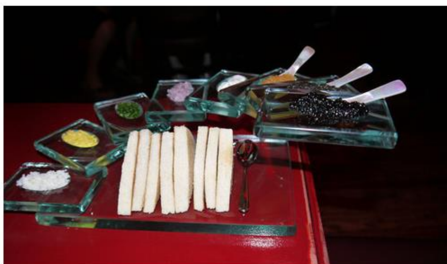
Caviar Trio at Red Square

Don't be thrown off by the casual look of Citizens Kitchen & Bar , nor assume this is a simple restaurant. Chef Massie put together a menu of high-end what has come to be known as "comfort food" in the recently opened restaurant in the heart of Mandalay Bay . The Citizens menu begins with continental breakfast, and moves to sandwiches, which you create, or have a soup and salad combination—and that is just for a warm-up. It is a little shocking to say with all of the great steakhouses in all of Las Vegas, but Citizens prepared the best filet mignon on the strip and placing it on top of the loaded mashed potatoes makes for one amazing meal. Everything that came out of the kitchen looked fabulous, but if you are looking for the over-the-top experience, how about chili-cheese fries with Kobe beef in the chili?! Citizens is an incredible restaurant with fabulous service and you have a perfect view of all that is going on in the hub of Mandalay Bay as you are dining.