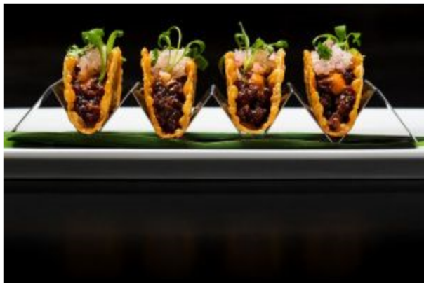
Kobe beef tacos are among the Asian fusion dishes at Kumi, a Japanese restaurant that opened this week at Mandalay Bay.